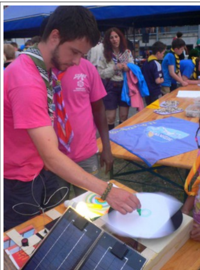
At the KISC.