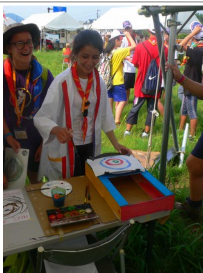
At the World Scout Jamboree.

It is a kind of 'record player' which works directly from a solar panel (no battery). We attach a sheet of paper to the disc and let it spin. The kids can paint on the rotating paper using either feltpens or liquid color and brushes. Let them wear an apron to protect their cloth and be ready to get some paint yourself... The kids can adjust the speed of the disc playing with the angle of the solar panel or shading part of a cell.