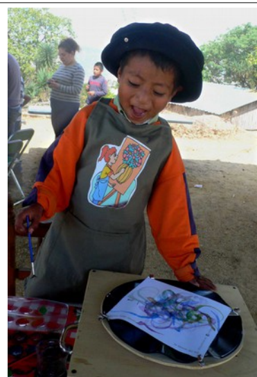
A young artist in Mexico.