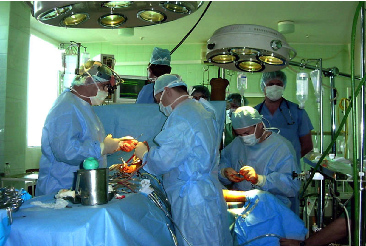
Doctors in a Manila hospital conduct heart surgery.

memberstates for epidemics, surgeries and other medical needs. The Philippines is targeting the medical alliance at African countries, which could benefit greatly from Filipino doctors, and with the inclusion of countries with medical tech (medtech) more advanced than the Philippines, global healthcare could improve greatly. Benigno Aquino III has also planned medical cooperation with Nusantara; which could involve Nusantara sharing it's medtech with the Philippines, and joint research projects into new and better medtech. Additionally, the Philippines has leased a contract for the construction on 20 surgical mask factories in Valenzuela City to a local engineering firm. The DOH, with governance of the Manilacare 2025 plan, has also began construction on new hospitals, yielding a combined 1.5k beds, out of the Philippines' planned capacity of 225k.